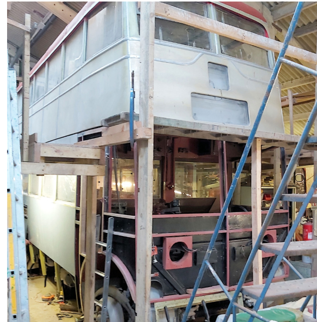
Offside view of the new panels

Your donations will help the museum to attract additional sums from funders. This project will make a huge difference to our ability to look after our historic vehicles, will improve the experience for our visitors and will transform the appearance of Sandtoft Square. Please donate now! DGC