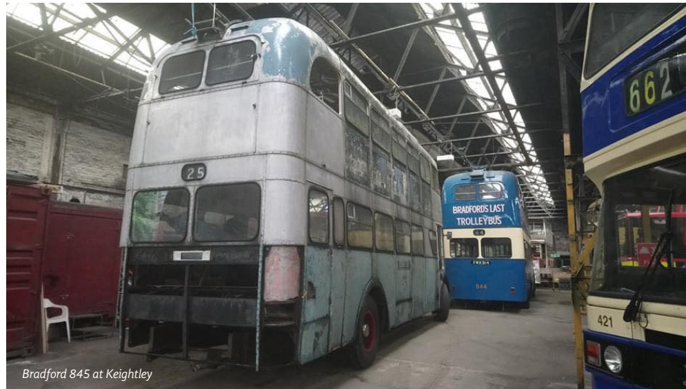
Bradford 845 at Keightley