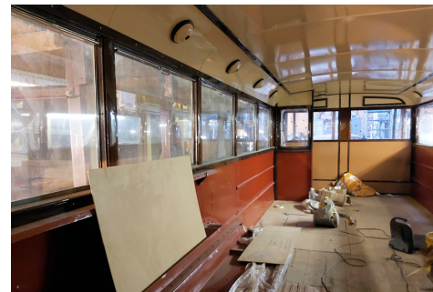
Lower deck interior

There have been some generous donations in recent months but all this activity has depleted the fund. However, the article we published in the last edition of Scene was reprinted in a recent Bus & Coach Preservation and we are hoping that this will generate further donations. We are grateful to the editorial team at Bus & Coach Preservation for the regular support for the Museum in their pages.