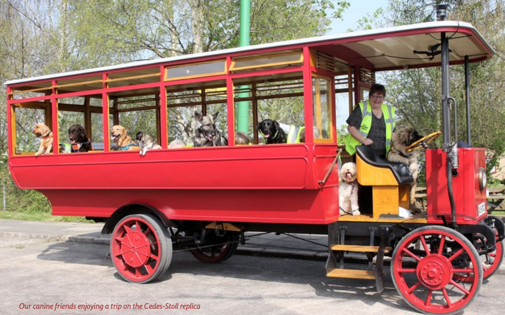
Our canine friends enjoying a trip on the Cedes-Stoll replica