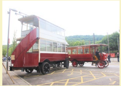
The Cedes returns from its trip round the car park with the Mayor and his Consort on board