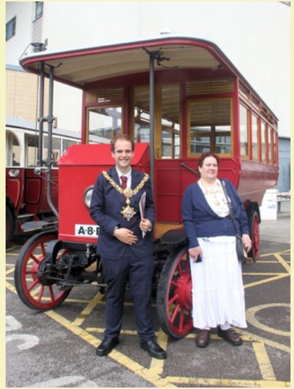
The Mayor and Mayor's Consort with the Cedes