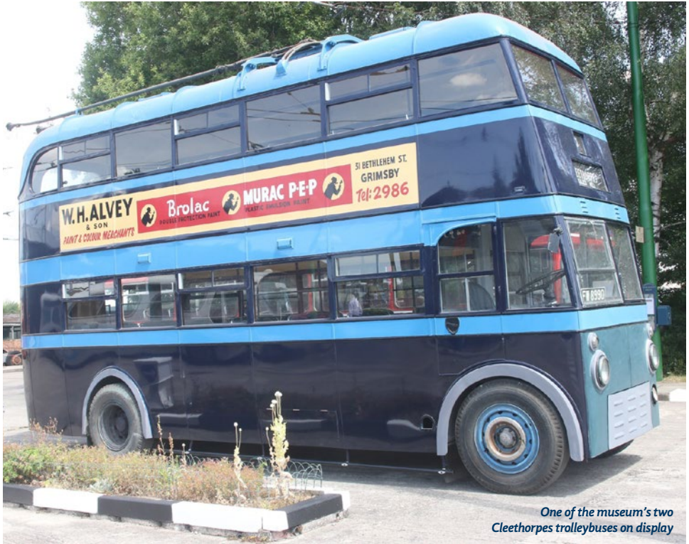
One of the museum's two Cleethorpes trolleybuses on display

The Trolleybus Museum at Sandtoft has been helping with the planning of this year's Heritage Open Days in Cleethorpes, where this year's theme is "On the Move", celebrating all forms of local transport, including trolleybuses and a submarine!