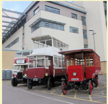
The Leyland, the Straker-Clough and the Cedes in position on day one, with the Trolleybus Museum stand in the background